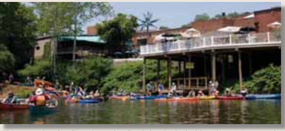
This year, for the first time, the final day included lunch at Manayunk Restaurant and Brew Pub. The Restaurant and Manayunk Dev. Corp. worked together to install the boat landing for paddlers.