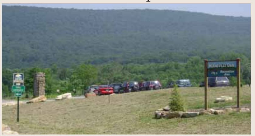
Visitors to the Bartram Trail trailhead will notice several improvements, including a sign for the Kernsville Dam Recreation Area (right), installed by Blue Mountain Wildlife.