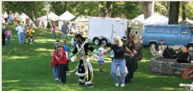
New this year was a Native American Village where festival-goers had a chance to learn about and participate in Native American folklore and culture.