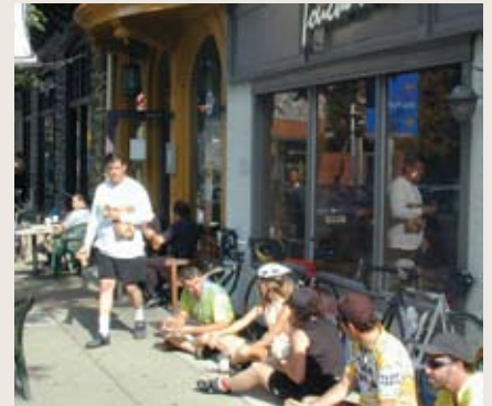
Bicyclists take a break in Manayunk, a major destination along the Schuylkill River Trail.

Eateries, bed and breakfasts, historic sites, bike shops and outdoor outfitters all stand to gain from the trail. But people won't stop at those businesses unless they know about them. Signage at trailheads listing services and tourism opportunities is one promotional tool that will be looked at. A map of the entire trail will be unveiled at the workshop and participants will be asked for their input about local trail amenities. This information and