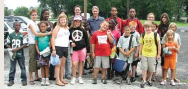
Gallery on High Camp

The Schuylkill Action Network (SAN) is now seeking to expand the fund by including contributions from additional businesses and corporations in an effort to support more water protection and enhancement projects across the Schuylkill River watershed.