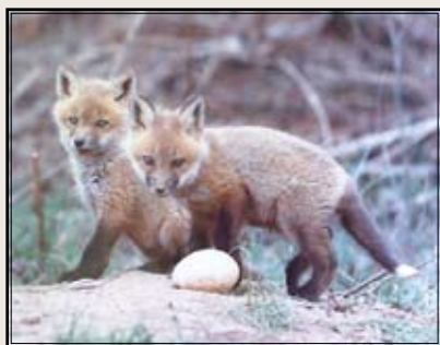
Foxes with Goose Egg Photograph by James Campion

Through January 4, 2009 at the Reading Public Museum , in Reading. This exhibition examines the art and design of the motorcycle through the lens of classic and contemporary cycles. Forty-six motorcycles are exhibited including two of the most famous of all time: the Captain America chopper and Billy Bike featured in the 1969 film, Easy Rider . They headline a section of the exhibition featuring early choppers of the 1960s and 70s. The original jacket and helmet worn by Peter Fonda in Easy Rider is also on display. Visit www.readingpublicmuseum.org for more information.