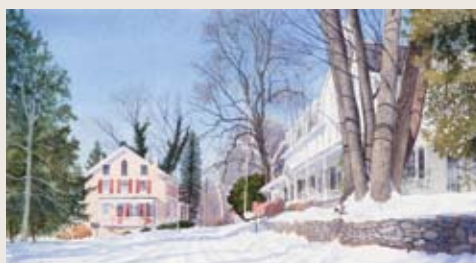
Hazel Kilp's watercolor Sun and Snow at Yellow Springs

For more information, contact the Heritage Area at 484-945-0200 or info@schuylkillriver.org .