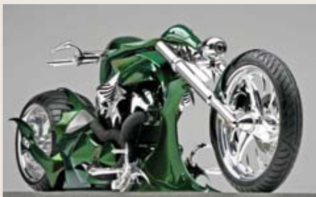
The Smackdown exotic chopper, winner of many national awards and featured on several TV programs, 2006, Courtesy of Tommy Graves Customs, TGC.