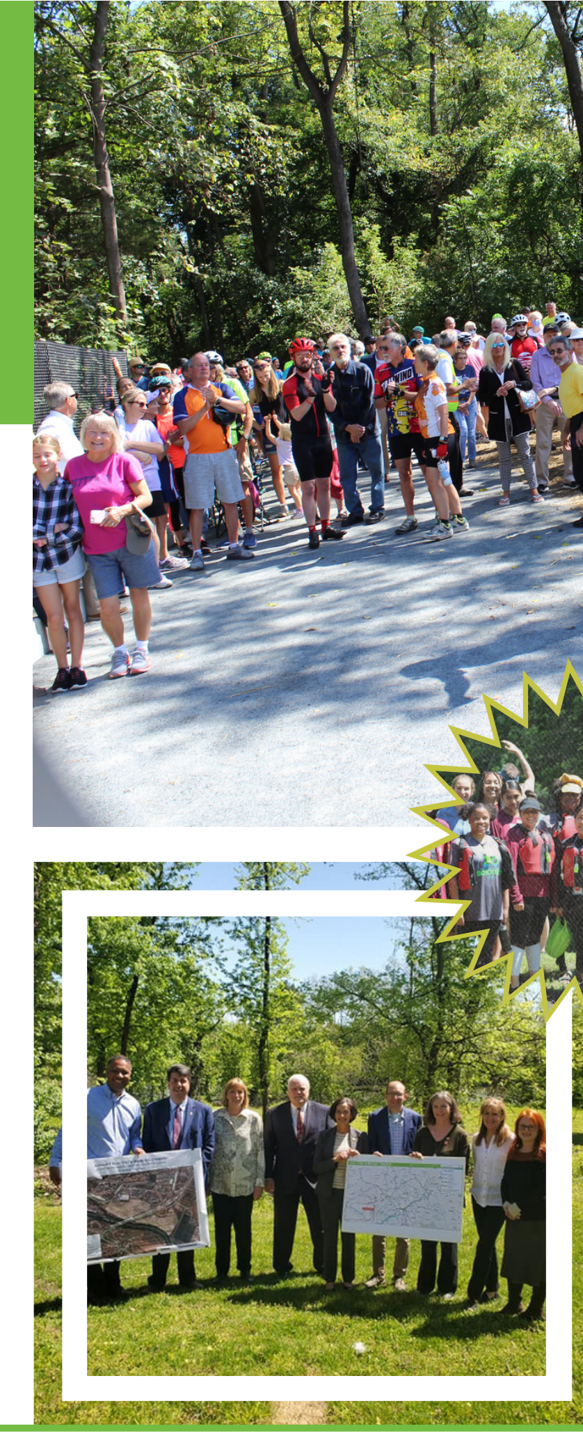
SCHUYLKILL RIVER GREENWAYS NATIONAL HERITAGE AREA